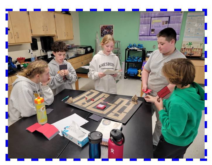
Middle School Math Games

For more information about the physical, mental and social benefits of risk taking, check out: Why Kids Need To Take Risks